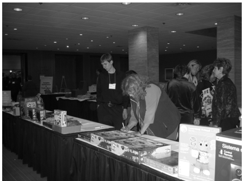
The silent auction was held on Friday for the first time ever and it was a great success. Thanks to all of you who donated items and to those of you who placed bids!