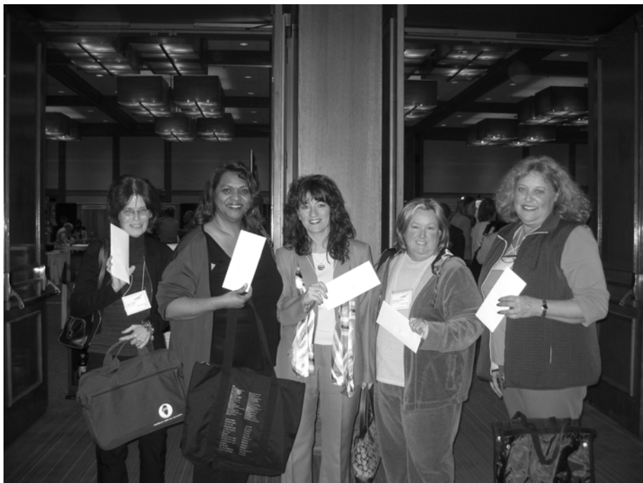
Fun Bucks Winners