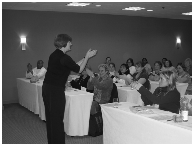
Conference attendees enjoy the breakout sessions.